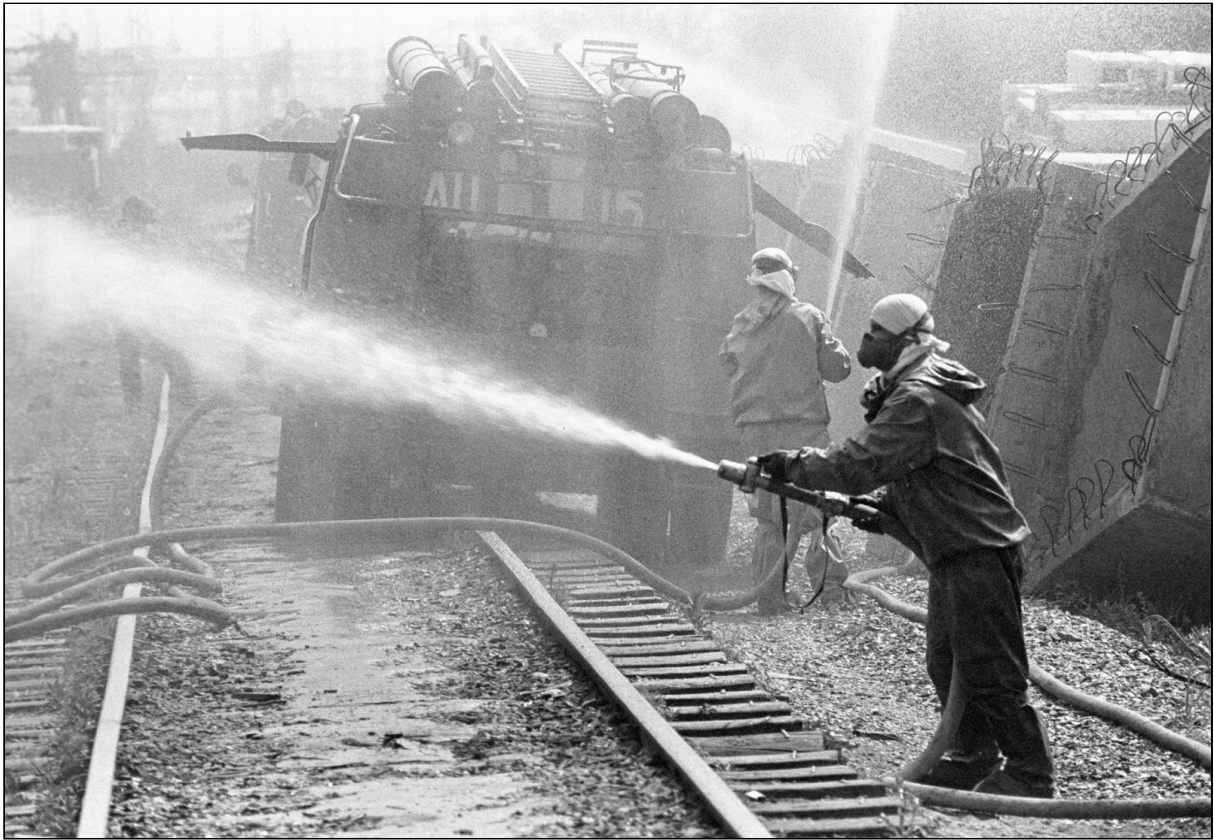
Firemen attempt to extinguish the flames devouring Chernobyl.