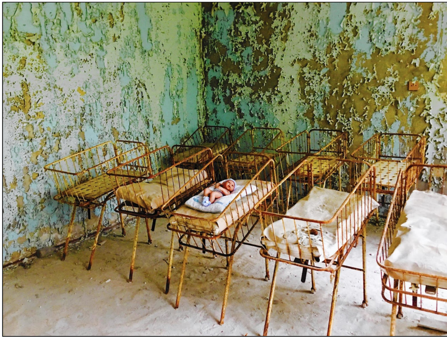
Disused cradles in the maternity ward of the Pripyat hospital.