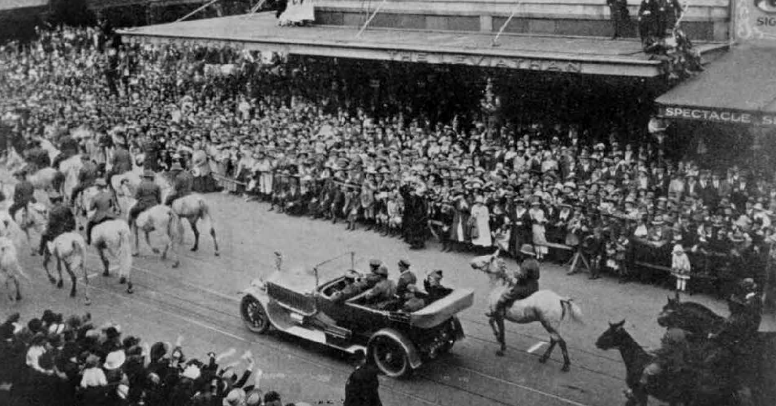
Archbishop Mannix led by fourteen Victoria Cross recipients in the 1920 St. Patrick's Day parade.